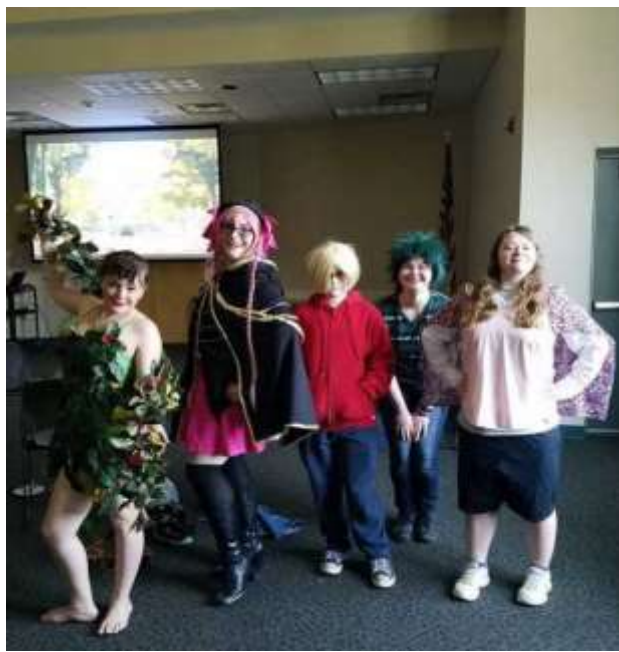
Teens dressed up as anime characters and superheroes for the last Anime Club of the school year!