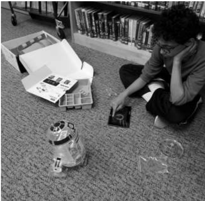
Figuring out our new littleBits robot during Teen Maker Friday! The robot was purchased with a Stewart's Grant.