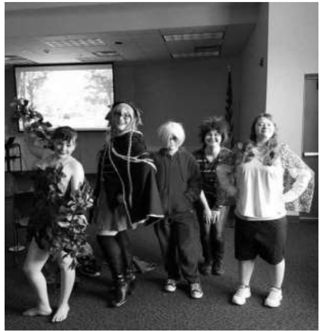
Teens dressed up as anime characters and superheroes for the last Anime Club of the school year!